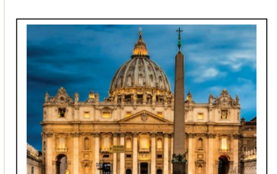
St. Peter's Basilica